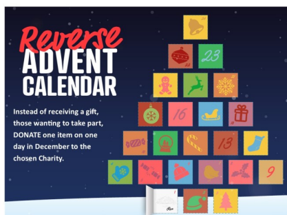
St. Margaret Mary's Homeless Outreach project.