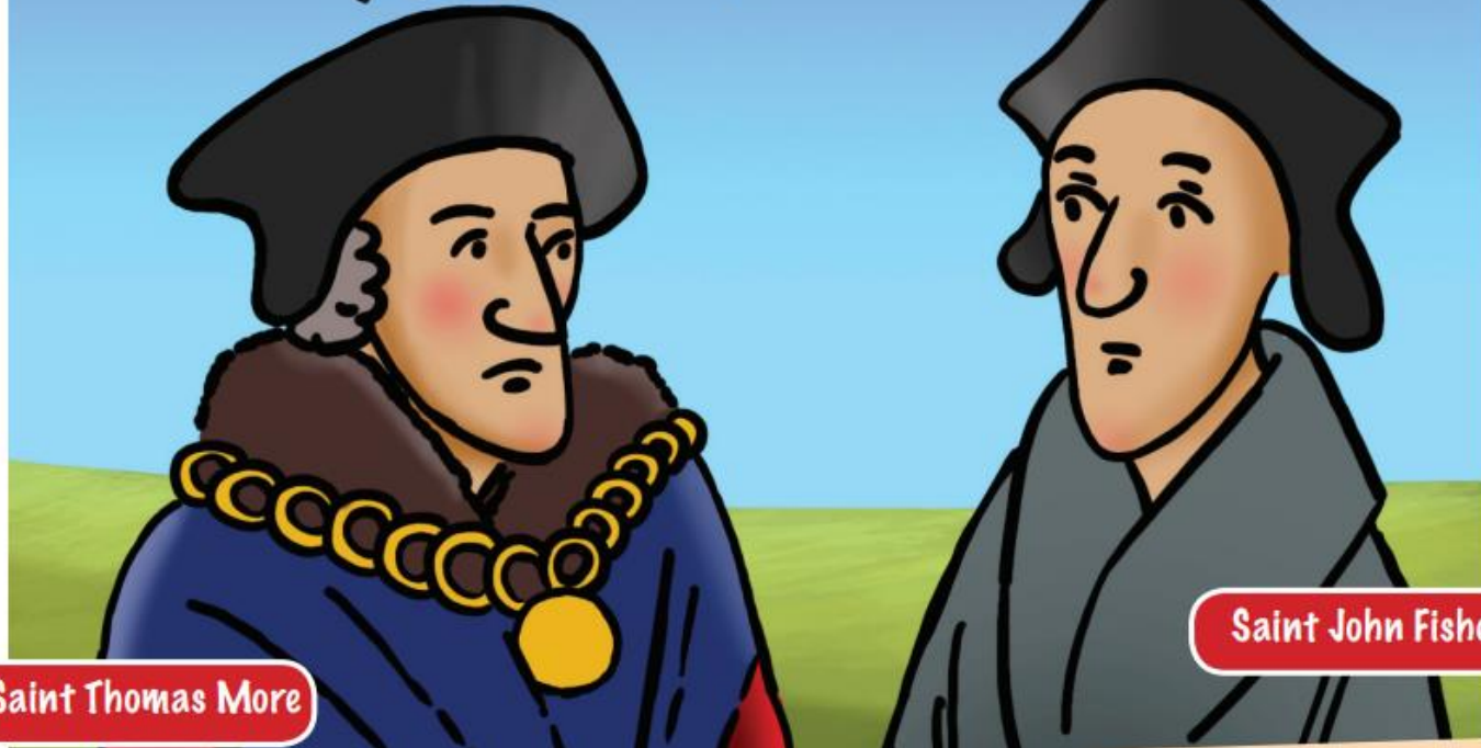
Saint Thomas More