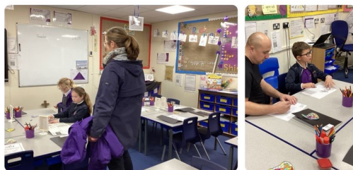
Year 3 and 4 Parent Art Workshop