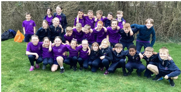
KS2 Cross Country Team